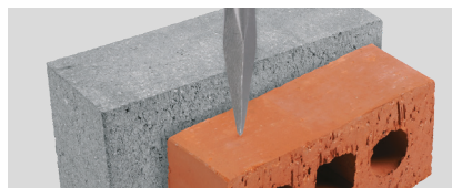
POINTED CHISEL KRT011020