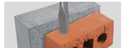
FLAT CHISEL KRT011021

Our +50 years of experience guarantee a professional and high quality service.