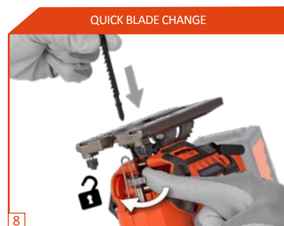
QUICK BLADE CHANGE